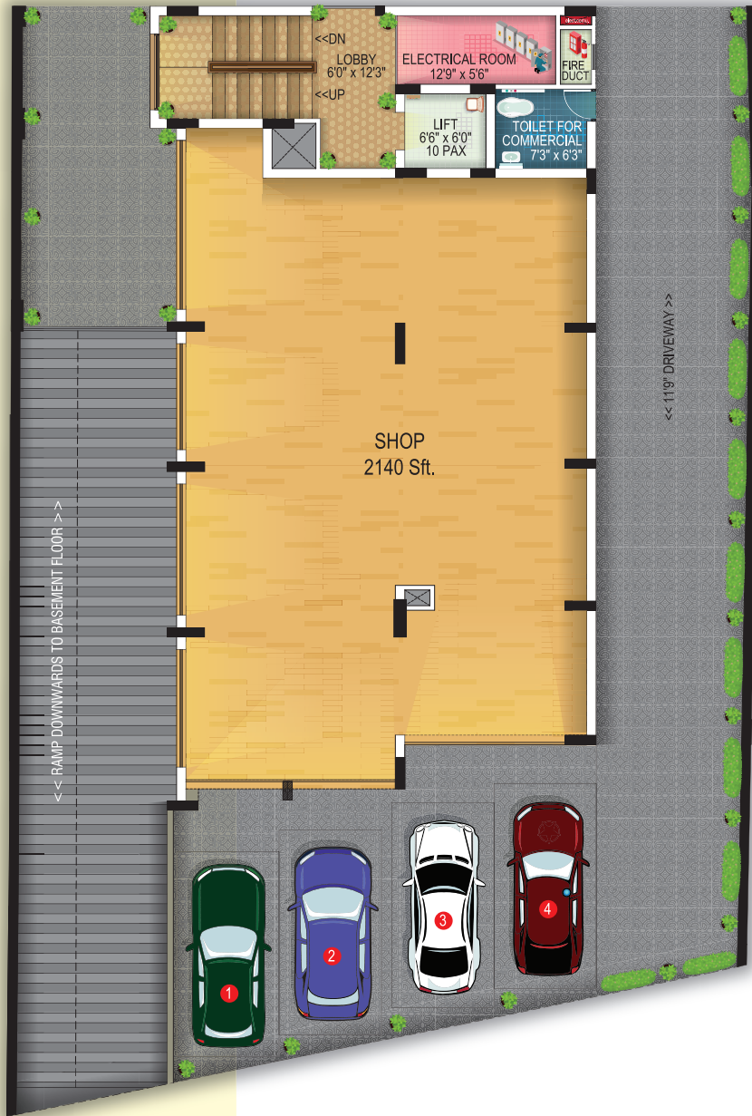
Shop - 2140 Sft.