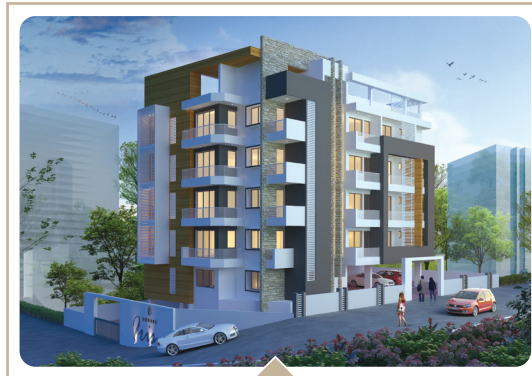
Sorake Iris Bejai, Mangalore