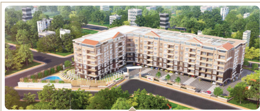
Nanda Deep Near Urwa Marigudi Temple, Mangalore