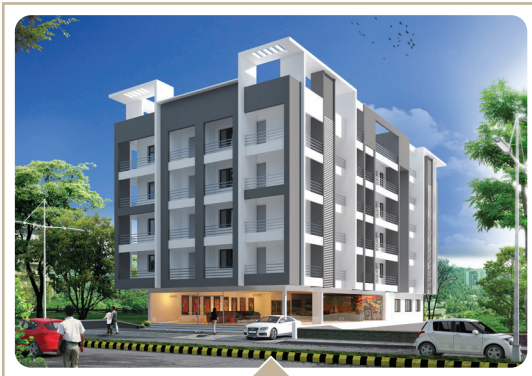
Sorake Greycliff Padavinangady, Mangalore