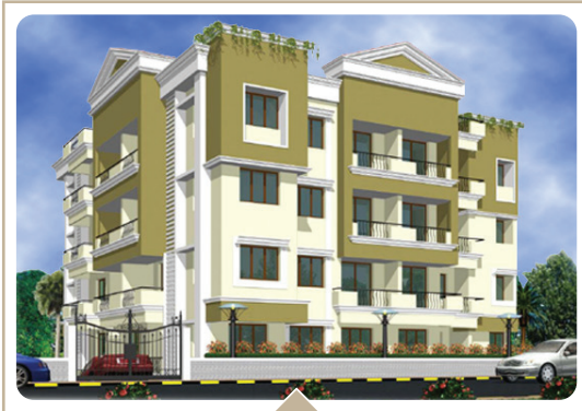
Sorake Elegance Urwa, Mangaluru